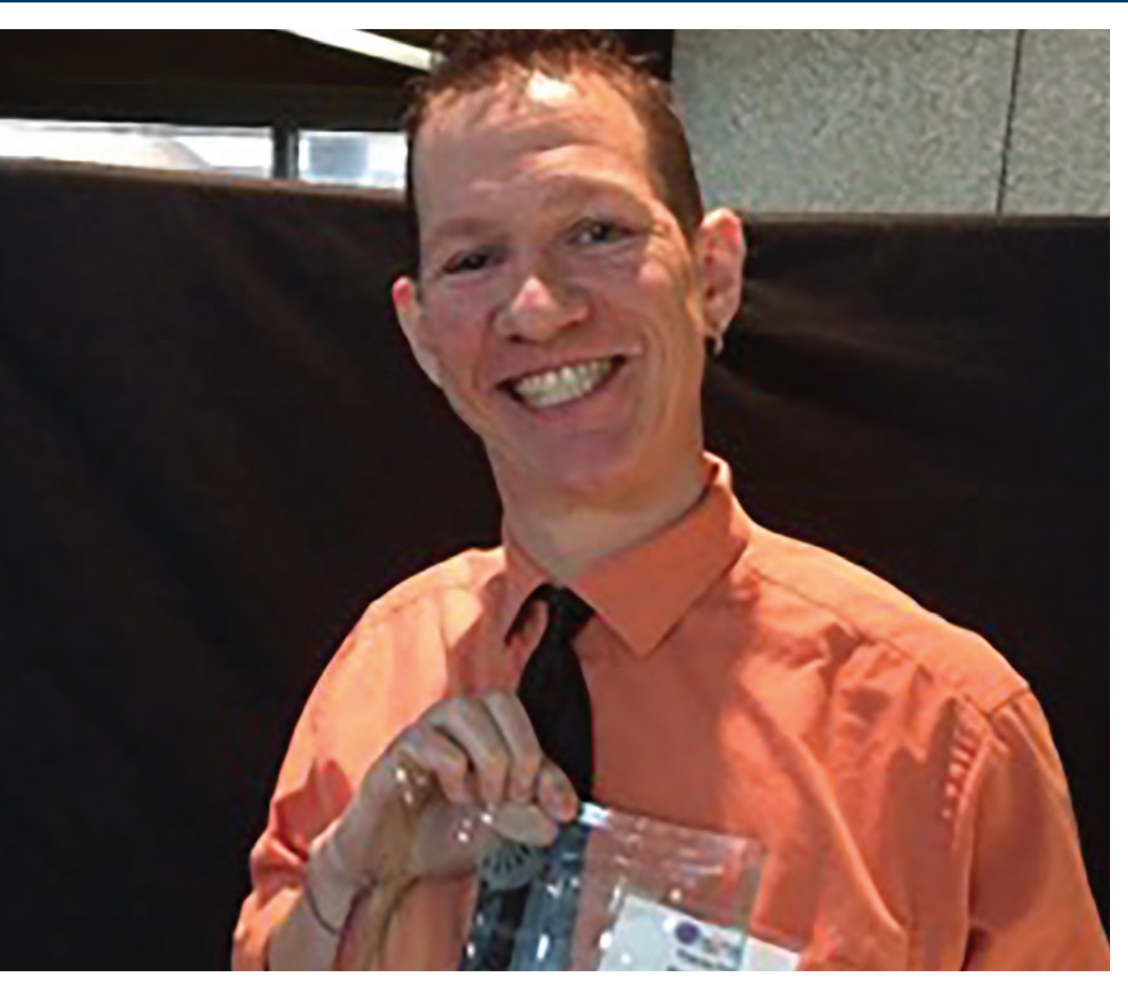
Receiving the Survivor of the Year Award.